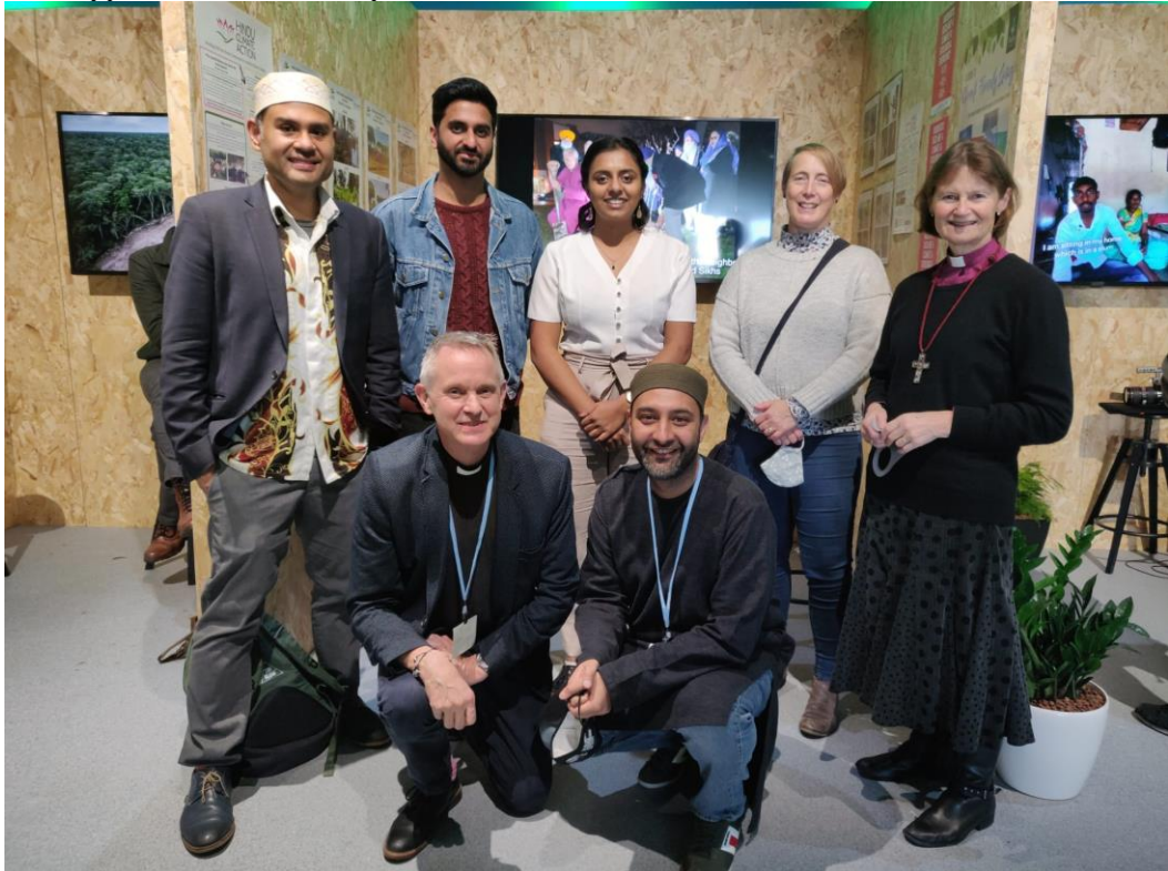
Our interfaith exhibition at the Green Zone, COP26 (with permission to share)

We support people of every faith and every kind of faith-based action for the climate, including advocacy and prayer, lifestyle change and meditation, shareholder engagement and divestment, and non-violent direct action for the climate.